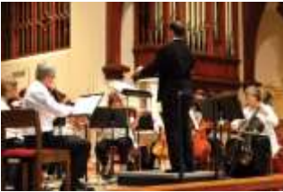
The Civic Orchestra of Jacksonville at their first performance at St. John's Cathedral