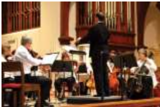
The Civic Orchestra of Jacksonville at their first performance at St. John's Cathedral