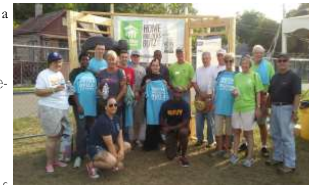
Group Shot of Blitz Build Team